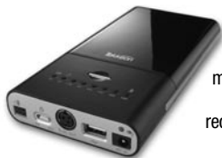
myPower ALL Plus lithium polymer rechargeable battery